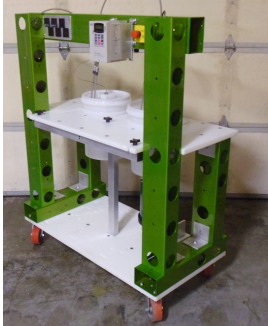
IS Model FEW 110V 60hz (50hz available) Plug-and-Play