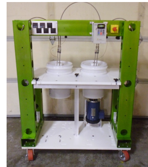
The Only System In The Market That Uses A 5 Gallon Bucket To Both Extract And Winterize In One Step