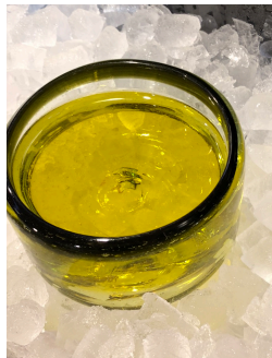
One Step Processing Botanical Oil 2-4 Pounds Input Bontanicals Per Hour 48-96 Pounds per Day 24/7